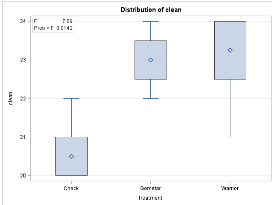
Figure 2. ANOVA Box plot distribution of the number of clean ears for Centre County in 2016. The treatments Gemstar and Warrior were different in the distribution of clean ears compared to the check at an alpha=0.05 (F=7.09, p=0.0142, DF=2).

The 2011 trial that included Gemstar had higher lepidopteran pest pressure (Table 3). All treatments had a higher number of clean ears than the untreated control, but the Gemstar-alone treatment was not significantly higher.