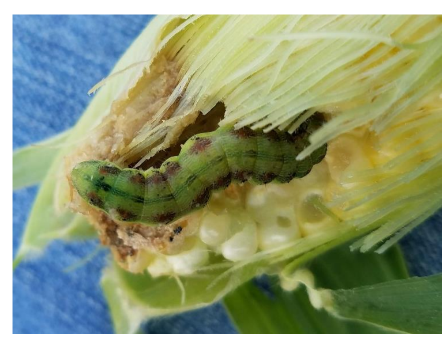
Fig 1. A larval corn earworm feeding on corn

Once the spray threshold is reached, you can consider products from the pyrethroid class, diamide class, or spinosyn class for effective control. We tend to see the best efficacy from non-pyrethroid products such as Coragen, Verimark, Blackhawk, and Radiant, as pyrethroid resistance has increased in migrating corn earworm populations. However, we tend to see more resistance later in the season than now, as moths migrate from further south in the United States up to our region. Diamides and spinosyns do not provide effective control of other pests such as sap beetles, brown marmorated stink bug, Japanese beetles, or adult corn rootworms. If you're seeing these pests as you scout your corn, consider adding a pyrethroid, or the premix Besiege to control those.