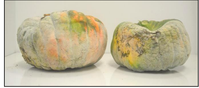
Powder sugar sporulation caused by Phytophthora blight on severely infected pumpkin fruit.

to wilt. Fruit lesions may have a water-soaked appearance and are