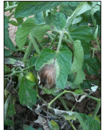
Severe late blight foliar lesions on tomato.