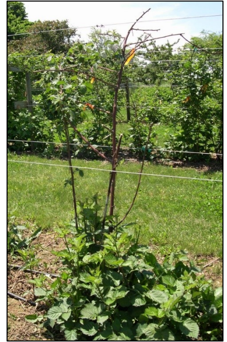
Thornless blackberry failing to leaf out due to a cane canker disease in combination with winter injury.

For an update on our more typical common diseases of gray mold ( Botrytis ) and anthracnose , including info on a new species of botrytis that is present in the Mid-Atlantic, resistance issues, and recommended chemical control options, see this article: https://extension.psu.edu/strategies-for-effective-management-of-botrytis-and-anthracnose-fruit-rot-in-strawberries