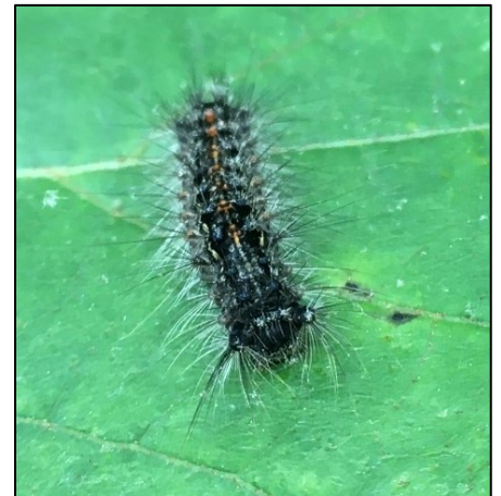
Spongy moth larvae with black head capsule, which indicates it is an early instar.