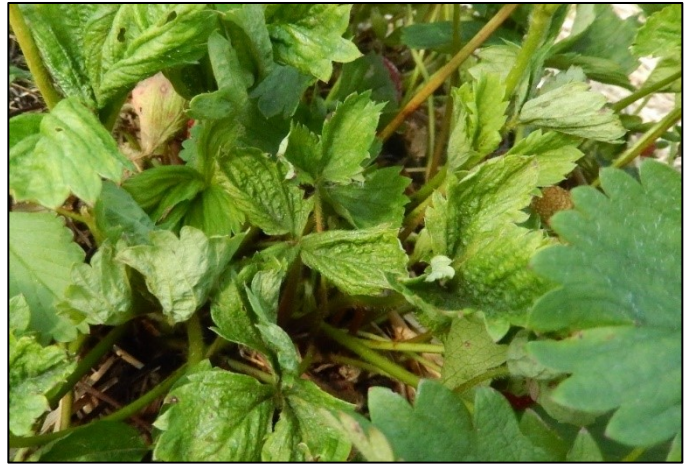
Discolored and malformed new strawberry leaves affected by cyclamen mites.

Cyclamen mite damage has been noticed in some strawberry plantings. Cyclamen mites are too tiny to see without a microscope, but the symptoms are noticeable and consist of new leaves being discolored and misshapen as they emerge. The symptoms could be mistaken for injury from a growth-regulator type herbicide but occur because the mite is feeding on new leaves in the crown of the plant as they are being formed. Predatory mites are effective but need to be released while cyclamen mite populations are still low, and damage is confined to a few plants. Chemical sprays are unlikely to have much effect at this time of the year, as the presence of foliage makes it difficult to get a miticide into the crown area, though renovation time is an option for matted-row producers. Use a high volume of water (200 gal/acre). Agri-Mek (abamectin) and Portal (fenpyroximate) both have efficacy against cyclamen mites.