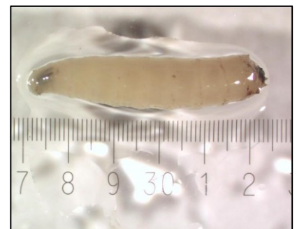
Seedcorn maggot larvae in millimeters (~5mm)