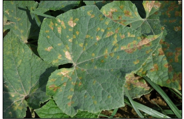
Classic symptoms of downy mildew on the upper leaf surface of cucumber. Angular lesions are initially chlorotic before turning tan and necrotic.