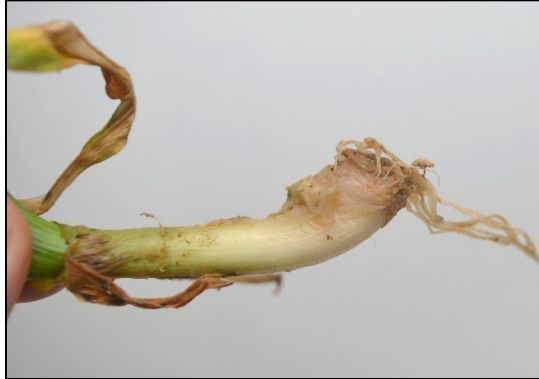
Garlic sample showing leaf tip chlorosis/necrosis (top left), soft, watery rot on internal garlic leaf (top right) and bulb rot symptom (left).