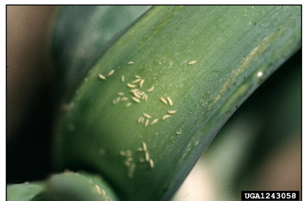
Thrips larvae on onion.

Emergence of the spring adults from overwintering pupae of Allium leafminer (ALM) is now over so it is time to start thinking about thrips . Onion thrips are the most common specie in onion, but other species, such as western flower thrips can also feed on onion. Thrips are also a common problem in greenhouses, feeding on flowers and young transplants. Both species have a wide host range, and some species transmit viruses. When scouting for thrips in onion, pull the center leaves apart and look down in the base of the leaves for the very small larvae. They will quickly scatter so a hand lens can be helpful. Severe feeding damage reduces the photosynthetic capacity of the plants and creates openings for bacterial and fungal pathogens to enter the plant. Thrips have also been reported in high tunnel tomatoes, cucumbers, and lettuce. An outbreak of spongy moth (formerly gypsy moth) was reported in several onion fields in central PA. Although onion is not considered a preferred host, larval feeding could still cause damage and create entry wounds for other pathogens. Products labeled for onion and other lepidopteran pests including the Btk strain of Bt ( Bacillus thuringiensis var. kurstaki ) could be used to spot treat if needed. Onion maggot has also been reported.