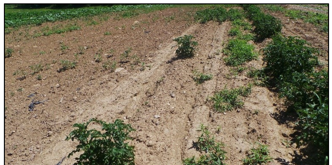
Poor stand establishment associated with blackleg and soft rot of potato.